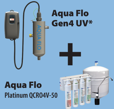
Aqua Flo Platinum QCRO4V-50