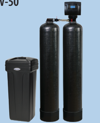
Hydrotech 89 HTO-150