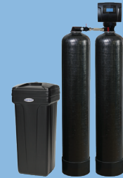
Hydrotech 89 HTO-150